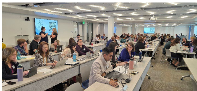
The gathering of members at the Regional Convening hosted at Riverside City College in November