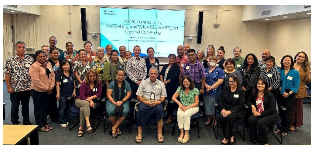
Some of the attendees at the Regional Convening hosted at Honolulu Community College in October

This week, invitations were sent out for the five convenings scheduled for 2025. We invite college administrators, faculty, staff, and trustees to participate in the conversations. Space can accommodate up to five attendees from each member institution at a designated regional convening. We look forward to seeing many of you at those convenings next year!