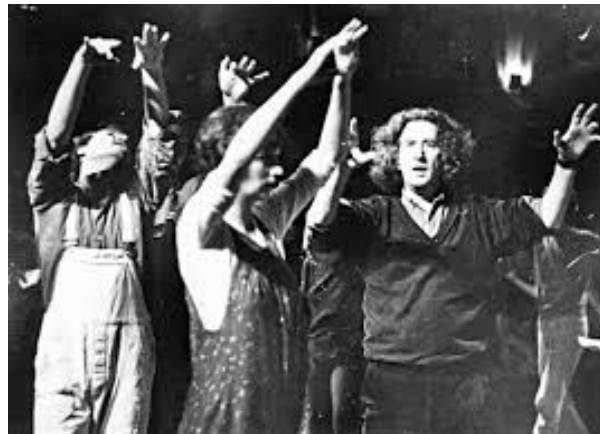
Image Theatre Exercise / Discuss

Image Theatre, Invisible Theatre, Forum Theatre, Legislative Theatre